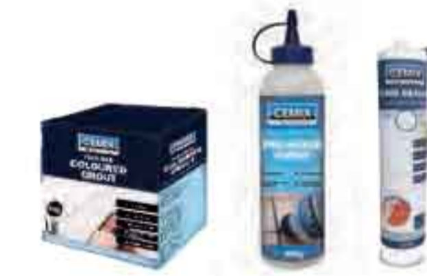
Grouts Pre-mixed grout, Wide Joint Grout, Coloured Grout or Tiling Sealant