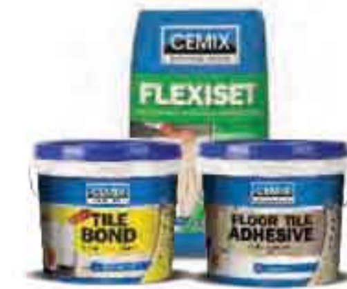
Tile Adhesive Flexiset, Super Tile Bond, Wall and Floor Tile Adhesive, Fast Set or Floor Tile Adhesive