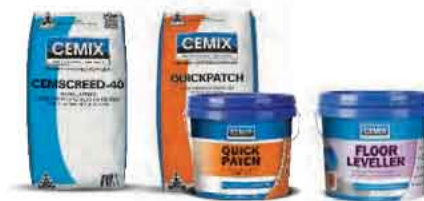
Floor Preparation Cemscreed40, Quick Patch or Floor Leveller

Use the guide below to determine which products from our range are suitable for your project. If you are still unsure about which products are suitable for your project, please visit www.cemix.co.nz or call our technical team at 0800 ASK CEMIX for further information.